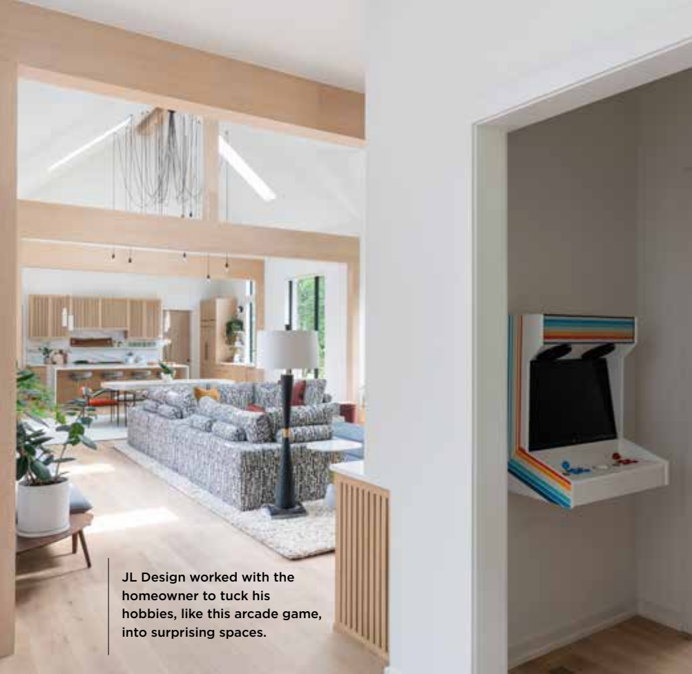
JL Design worked with the homeowner to tuck his hobbies, like this arcade game, into surprising spaces.