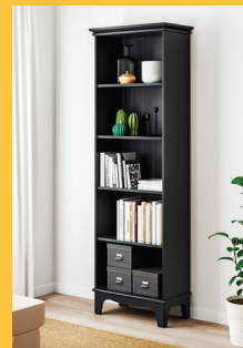
LOMMARP BOOKCASE, $180, IKEA.COM