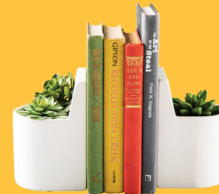
BAYLIS CERAMIC BOOKEND SET, $22, MAGNOLIA.COM